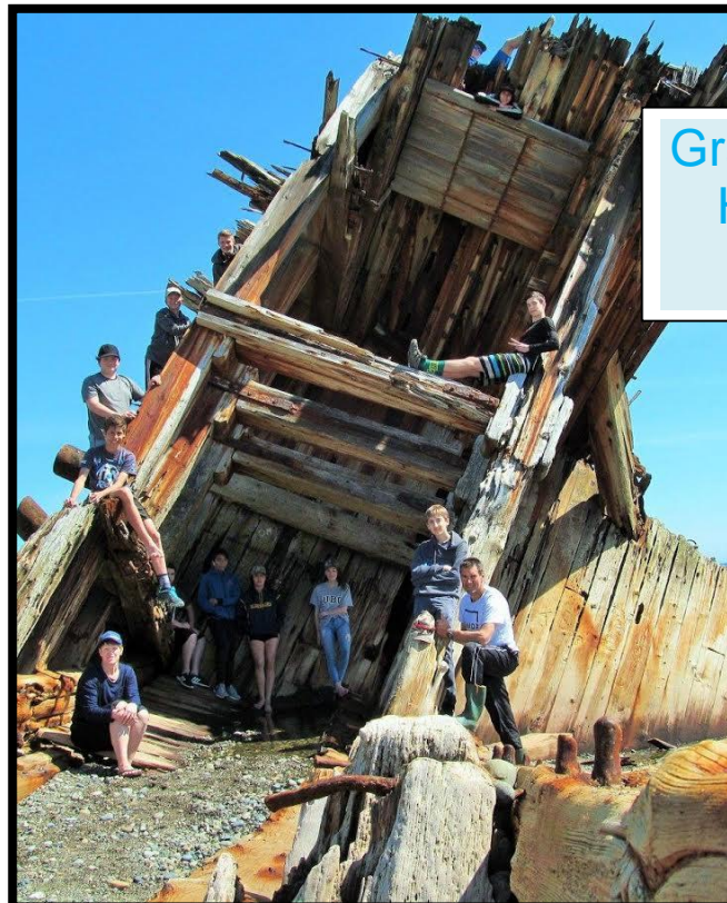
Grade 10 Trip to Haida Gwaii 2017!

**NOTE** - Students must be at all Exams at least 15minutes before the start of the exam